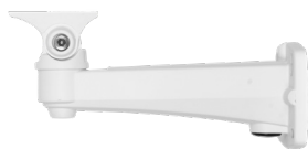
ZN - BK01 Wall bracket